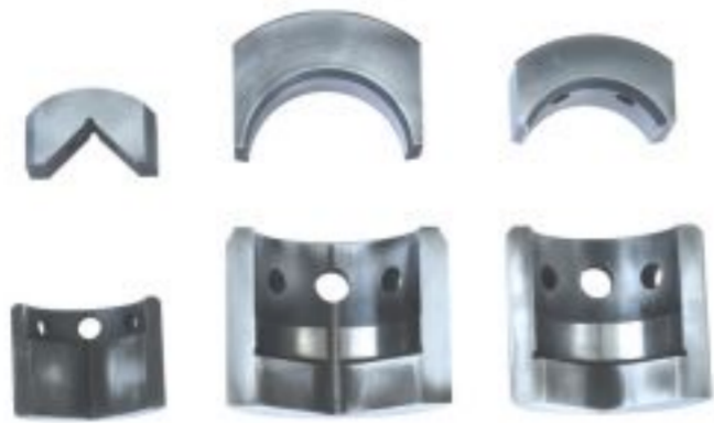
UPPER & LOWER LOCK PIECE