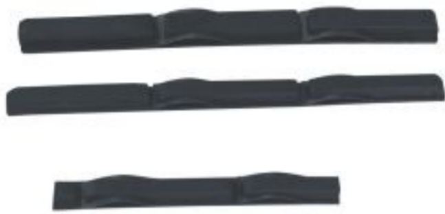
RUBBER LEDGES & FLAT SPRING