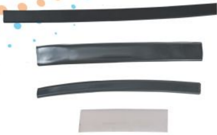
FLAT TUBE (PU, RUBBER)